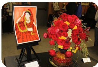
Spring is Blooming Throughout the Needham Public Library

Now in its 4th year, Needham's Art in Bloom 2012 will return, by popular demand to the Needham Public Library on Saturday March 3rd (9 am – 5 pm) and Sunday, March 4th (1pm - 4 pm). There will be 25+ colorful floral interpretations of art by members of the Beth Shalom Garden Club. Next to each floral design will be a creative piece of artwork provided by talented Needham High School students. This complimentary event has been generously sponsored by Roche Bros. Supermarkets. More information is available at: www.NeedhamArtinBloom.com .