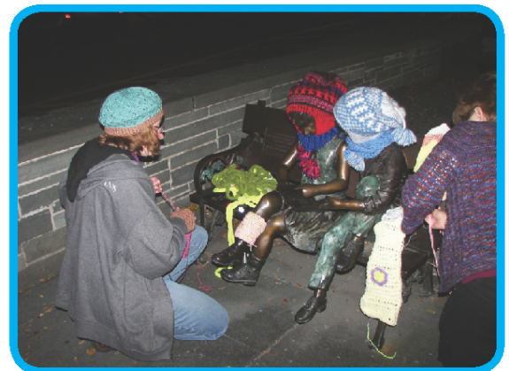
Members of the Metrowest Knitters "Yarn Bombing" a statue last month at the Library.

A type of graffiti or street art that employs colorful displays of knitted or crocheted cloth, rather than paint or chalk. While yarn installations--called yarn bombs or knit bombs--may last for years, they are considered non-permanent, and, unlike graffiti, can be easily removed if necessary. The practice is believed to have originated in the U.S. with Texas knitters trying to find a creative way to use their leftover and unfinished knitting projects, but it has since spread worldwide.