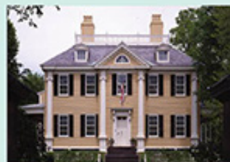
March 8th: Longfellow House - Washington's HQ