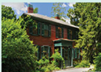
March 1st: Frederick Law Olmsted National Historic Site