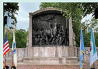
March 15th: Boston African American National Historic Site

Virtual Talks - Every Wednesday in March @ 12:00 PM