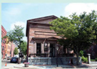
March 22nd: New Bedford Whaling National Historical Park

This series is available courtesy of the Tewksbury Public Library