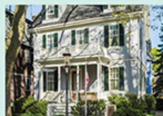
March 29th: John Fitzgerald Kennedy National Historic Site

This series is available courtesy of the Tewksbury Public Library